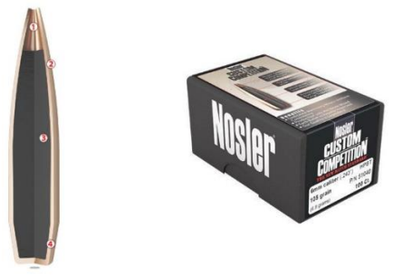
Nosler Custom Competition hollow-point rifle bullets include: 1) a hollow point that provides small meplat for increased aerodynamic efficiency, 2) a quality jacket, 3) lead-alloy core for stability, and 4) boattail design for optimum flight characteristics at multiple velocities

Now, decades later, high power competitors rely on hollow-point boattail match bullets for serious competition. Civilian shooters had no choice but to handload such bullets until the mid-1970s. At that time, ammunition manufacturers began offering factory-loaded, match-grade rifle ammunition in selected calibers with hollowpoint boattail bullets. U.S. military shooting teams also found it necessary to handload hollow points to remain competitive. In the early 1980s, increased military demand for match ammunition loaded with hollow-point boattail bullets led the U.S. Army to adopt the 7.62mm M852 match cartridge made at Lake City Army Ammunition Plant using bullets purchased from qualified, outside sources.