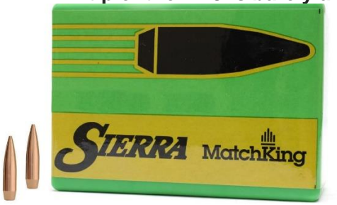
Many bullet manufacturers, including Sierra Bullets, have found it easier to build concentric, balanced hollow-point boattail bullets than FMJs

Many shooters feel the sharp point on an FMJ bullet will slice through the air better than a hollow point bullet which has a small flat (or meplat) across the tip. While the sharp point of the FMJ bullet is slightly more efficient than the hollow point design, the difference is minimal. This is because tip drag on a pointed bullet accounts for less than five percent of total drag. In real terms therefore, the sharp tip of the FMJ is barely a percent or two more efficient than the hollow point.