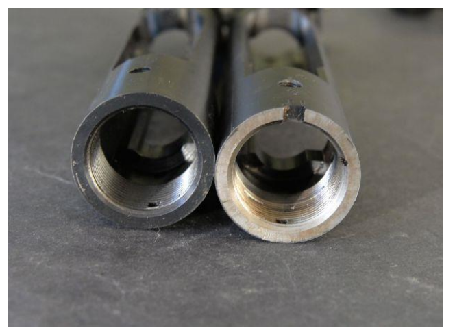
A front view of both receivers. The Savage (right) had a notch located to the bottom front edge of the receiver, this allows for indexing of lugs with an indexing pin.

The Savage (left) uses a tang mounted three position safety. In its rear most position, the bolt is locked and rifle won't fire (Full Safe), in the middle position the bolt can be manipulated without firing the rifle (Mid Safe), when the safety is off, the bolt can be manipulated and rifle fired (Off). The bolt release lever is located on the right side of the receiver, forward of the bolt handle. The Remington 700 (right), uses a two position safety. When the lever is to the rear, the rifle cannot fire and the bolt can be manipulated, when the lever is forward, the rifle can fire and the bolt can be manipulated. Note: on older Model 700s, the safety locked the bolt when it was engaged.