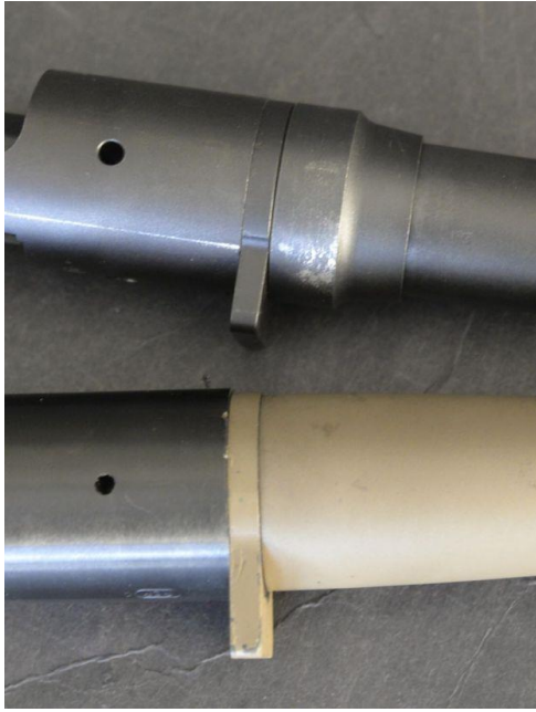
Perhaps the most noteworthy difference between the Remington and Savage, is the method used to attach the barrel to the action and determine headspace. The Savage (top) uses a barrel nut system, while the Remington (bottom), uses a precut shank.