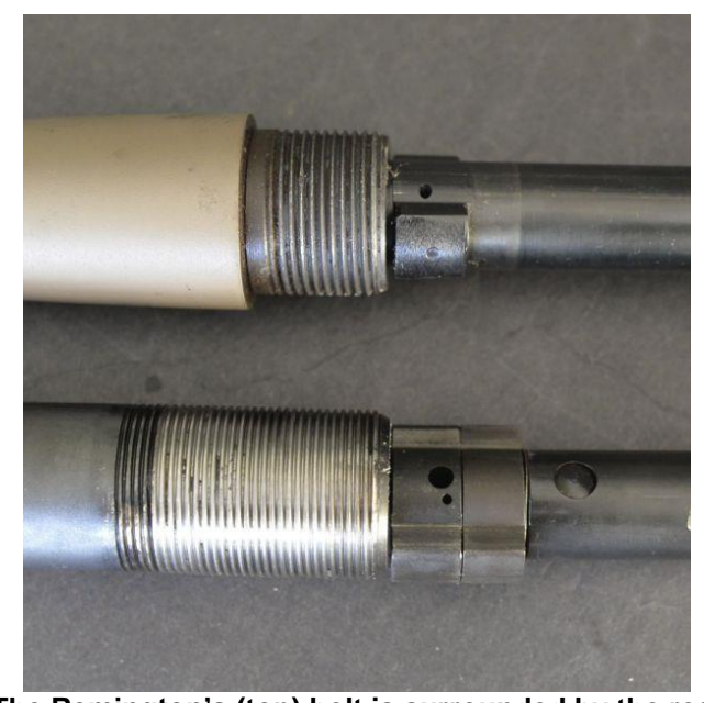
The Remington's (top) bolt is surrounded by the rear of the barrel tenon when it is installed. This is intended to slow down escaping gases and protect the shooter if a failure is experienced with ammunition. The savage bolt has a slight gap between the rear of the barrel and the face of the bolt.

Both receivers work well and can be used as the foundation for accurate rifles. So what are you thoughts? Similarly equipped Savage rifles tend to cost less than Remington. The barrel nut system and interchangeable bolt heads on the Savage make for easier caliber changes. If you like to tinker around with guns, are on a budget, and don't have access to a lathe- the Savage is hard to beat. While it wasn't discussed above, the factory Savage Accutrigger, is one of the best mass produced triggers I've encountered on a rifle.