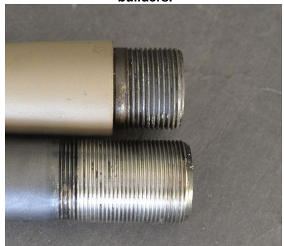
A comparison of barrel shanks with the Savage's (bottom) barrel nut removed. The threads have an external diameter of 1 1/16", however, the Remington (top) has 16 threads per inch, while the Savage has 20 threads per inch. Due to design considerations, the Remington can use barrel with a shank up to 1.250", however, the Savage is limited to 1.060". The Savage system head spaces with the barrel nut system. This allows barrels to be changed and head spaced without a lathe and is often considered a major advantage. Note: the Savage barrel shown above is a so-called "small shank", a larger shank diameter is used on rifles chambered in magnum and short magnum cartridges.