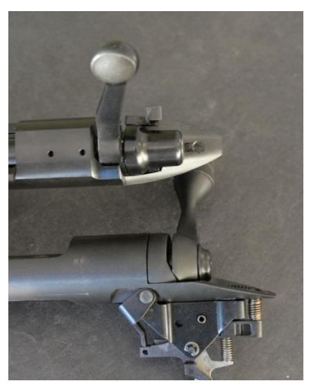
Primary extraction for the Remington 700 (top) occurs when the bolt cams against the rear of the receiver. Primary extraction for the Savage. occurs when the bolt handle cams against rear baffle assembly.