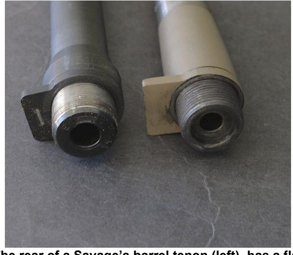
The rear of a Savage's barrel tenon (left) has a flat surface. The Remington (right) has a bolt nose recess.