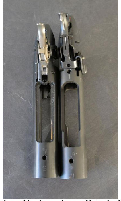
A bottom view of both receivers. Note the location of location of the action screws for both models. The Remington (left) has an action screw located at the front of the receiver and on the rear of the tang. The Savage has both screws located in front of the trigger guard. The proximity of the screws to each other on the Savage, make bedding with bottom metal a little more difficult. The magazine well on the Savage is longer.