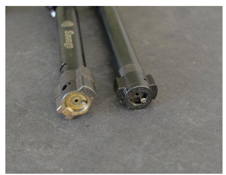
A front view of both bolts. The bolt lugs of a Savage (left) are flush with the bolts face, while the lugs on the Remington (right) are set back approximately .150"- this is necessary for the "three rings of steel" Remington advertises (and shown below) as a safer system for rifles. Both use a spring loaded constant tension ejector. The Savage extractor slides in from the side and engages the case rim, it uses an extractor, spring and pin. The Remington extractor is a one piece spring that does not cut into the continuous ring of steel around the bolt nose. I've personally found the Remington extractor more reliable than the Savage extractors.