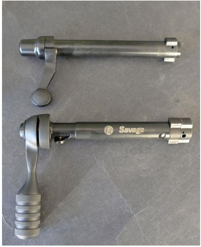
Remington (top) uses a one piece bolt bolt body and fewer parts. The bolt head, body and handle are all soldered together at the factory. Savage has a floating bolt head, secured by a removable pin, that allows the bolt head to be easily changed if a different size is needed.