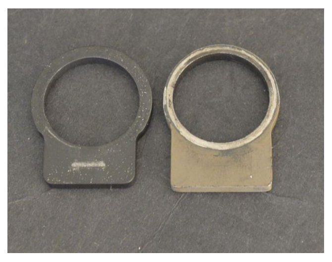
The design of both lugs is fairly similar (Savage, left, Remington, right). Neither has a reputation for being particularly flat. Both are often surface ground flat or exchanged for an aftermarket product by custom gun builders.