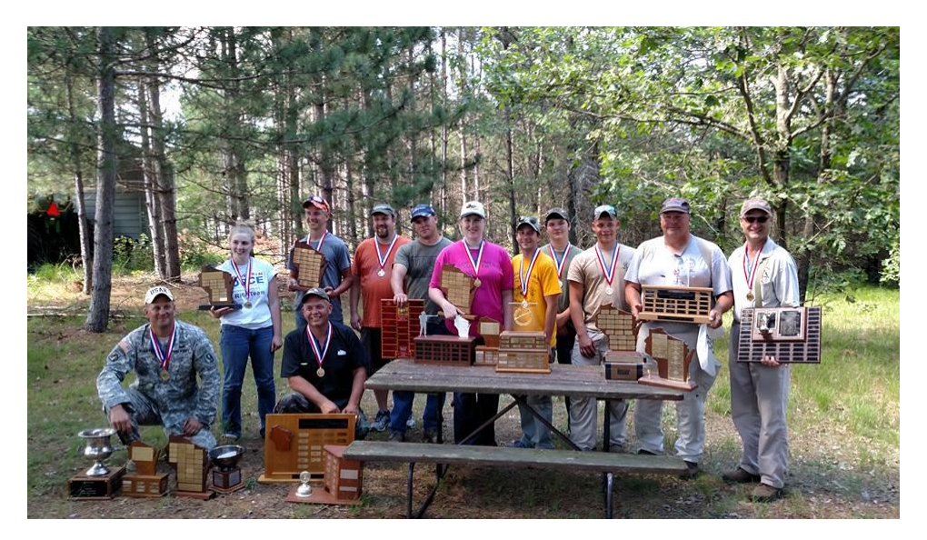
Award Winners from the State Highpower Match