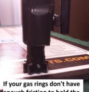
If your gas rings don't have enough friction to hold the weight of a clean and lubed carrier they are worn out.

Bullet seating depth: Seating your short range ammo out to maximum cartridge overall length seems like a good idea until every once in a while a HPBT bullet has a tiny little bit of extra jacket material that extends its length (your bullet seater doesn't contact this to correct it) just enough to cause a round to