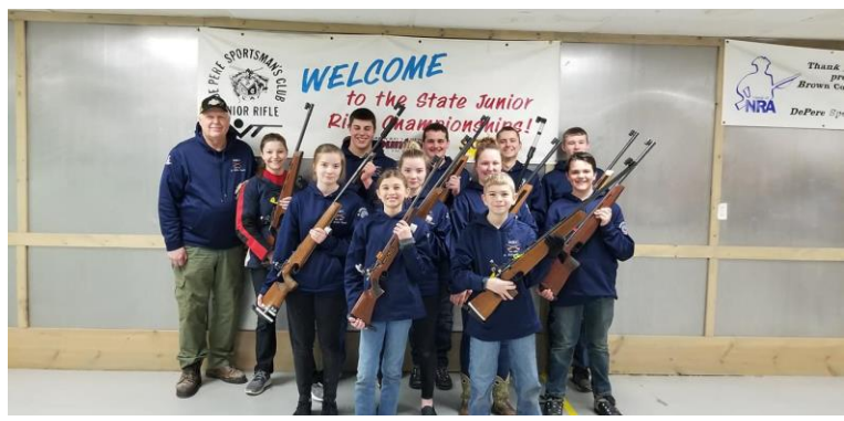
Medford Rifle Club Team