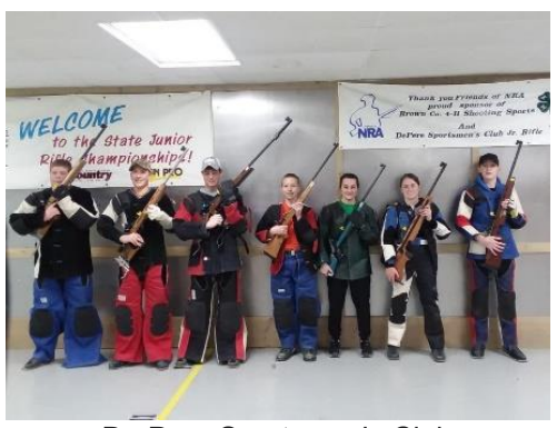
De Pere Sportsman's Club